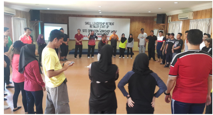
LEARNING ADMINISTRATION PARTNER & ORGANIZER FOR TRAINING EVENTS